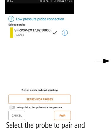
elect the probe to pair and press " Pair" .