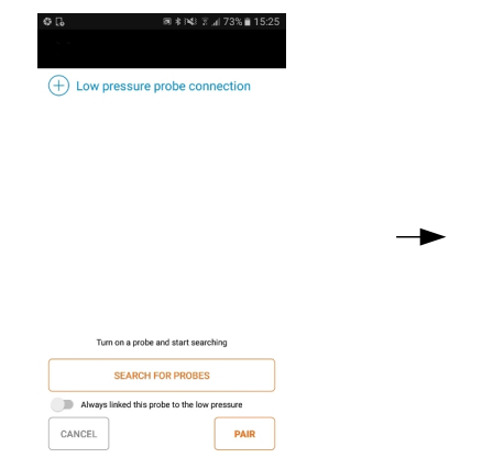
Press "Search for probes".