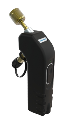
Turn on the low pressure probe.