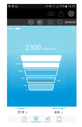
After a few seconds, measured values are displayed.