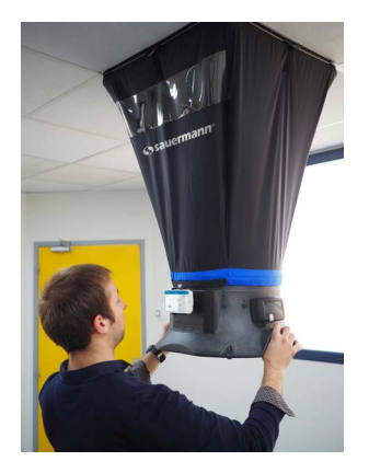
Use of the air flow meter