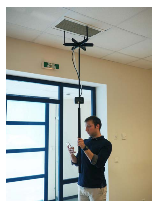
Use with the measurement grid