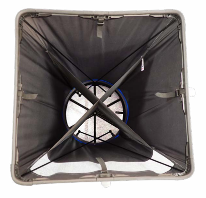
Hood with flow straightener