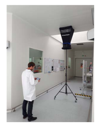
Use with the telescopic tripod