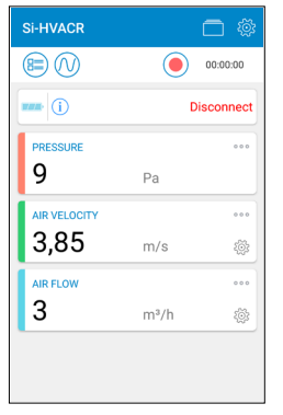
Example with a Si-PM3