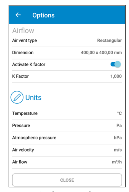
Options - Units