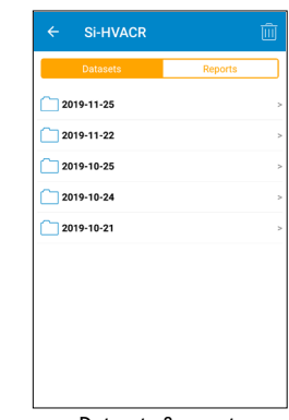
Datasets & reports

Delete existing files: select the items to delete then click "Delete" to confirm.